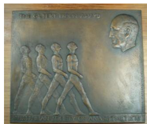
Gilbert Brown Medal (front)