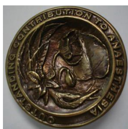
Pugh medal (back)