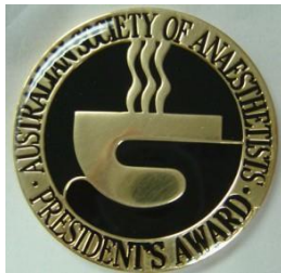
President's Award (front)

The recipient of the award will have their name entered on the honour board and receive a medal and citation. The award is presented at a time and place determined by the President.