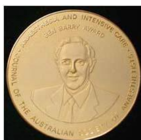
Ben Barry Medal (front)

The recipient will be presented with a medal.