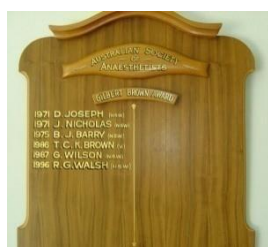
Gilbert Brown Honour Board