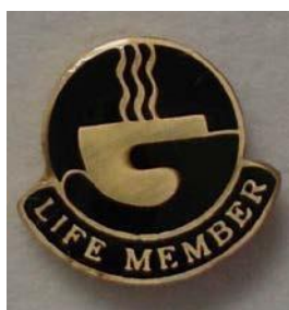
Life Member lapel badge