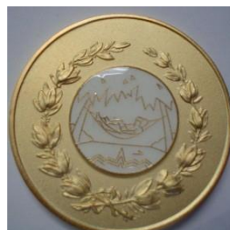
Seruvatu Medal (back)