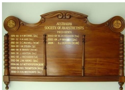
President's Honour Board