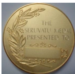
Seruvatu Medal (front)

The award comprises a medal, known as the Seruvatu Medal, which is presented at the Fiji School of Medicine graduation ceremony.