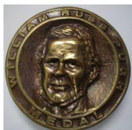
Pugh medal (front)