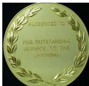
Ben Barry Medal (back)