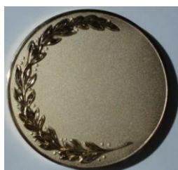
ASA Medal (back)