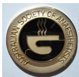
ASA Medal (front)

The ASA Medal consists of a bronze medal accompanied by a certificate. Recipients’ names are placed on an Honour Board in the National Headquarters.