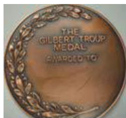
Gilbert Troup Medal (back)