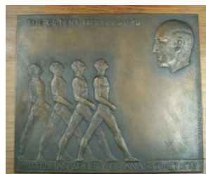
Gilbert Brown Medal (front)