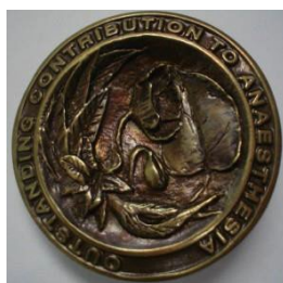
Pugh medal (back)