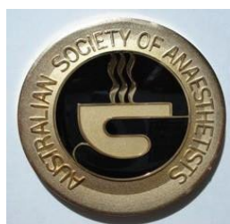
ASA Medal (front)

The ASA Medal consists of a bronze medal accompanied by a certificate. Recipients’ names are placed on an Honour Board in the National Headquarters.