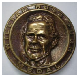
Pugh medal (front)