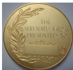
Seruvatu Medal (front)

The award comprises a medal, known as the Seruvatu Medal, which is presented at the Fiji School of Medicine graduation ceremony.