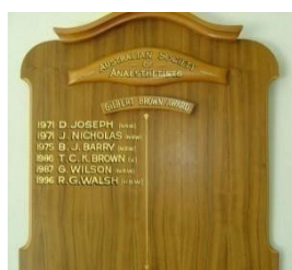
Gilbert Brown Honour Board