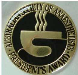
President's Award (front)

The recipient of the award will have their name entered on the honour board and receive a medal and citation. The award is presented at a time and place determined by the President.