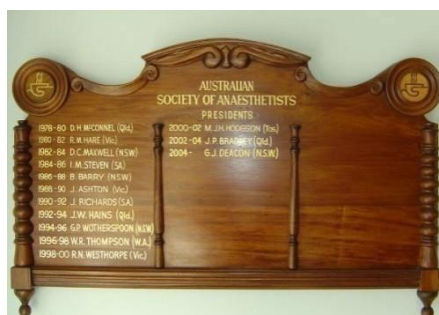
President's Honour Board