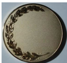
ASA Medal (back)