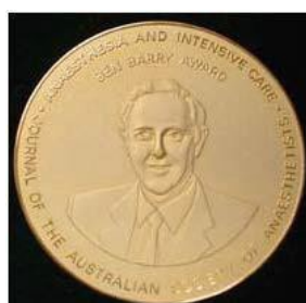
Ben Barry Medal (front)

The recipient will be presented with a medal.