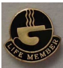
Life Member lapel badge