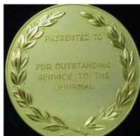
Ben Barry Medal (back)