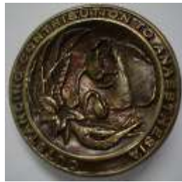
Pugh medal (back)