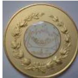
Seruvatu Medal (back)