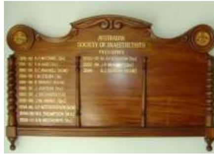
President's Honour Board