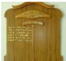
Gilbert Brown Honour Board