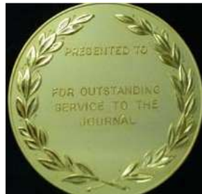
Ben Barry Medal (back)