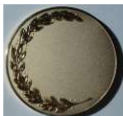
ASA Medal (back)

This document is confidential material of the Australian Society of Anaesthetists and is not to be further distributed, published or broadcast without the express permission of the Company Secretary.