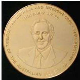
Ben Barry Medal (front)

The recipient will be presented with a medal.