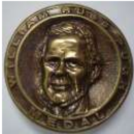
Pugh medal (front)