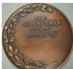
Gilbert Troup Medal (back)