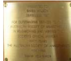
Gilbert Brown Medal (back)