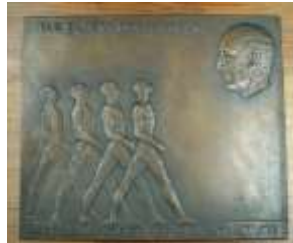
Gilbert Brown Medal (front)