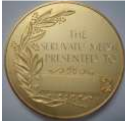
Seruvatu Medal (front)