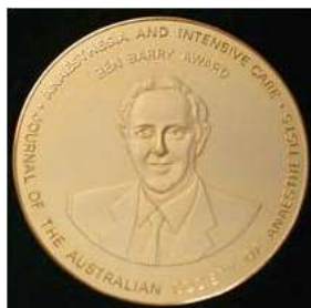
Ben Barry Medal (front)

The recipient will be presented with a medal.