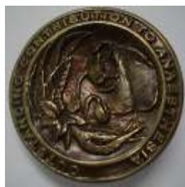
Pugh medal (back)