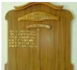
Gilbert Brown Honour Board