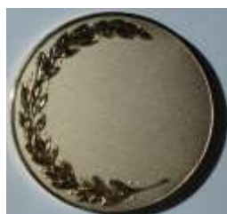
ASA Medal (back)

This document is confidential material of the Australian Society of Anaesthetists and is not to be further distributed, published or broadcast without the express permission of the Company Secretary.