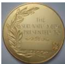
Seruvatu Medal (front)

The award comprises a medal, known as the Seruvatu Medal, which is presented at the Fiji School of Medicine graduation ceremony.