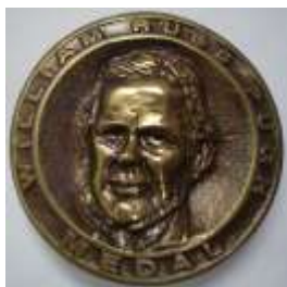
Pugh medal (front)