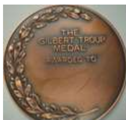
Gilbert Troup Medal (back)