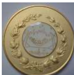
Seruvatu Medal (back)