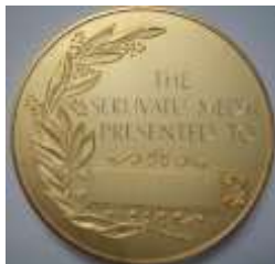
Seruvatu Medal (front)

The award comprises a medal, known as the Seruvatu Medal, which is presented at the Fiji School of Medicine graduation ceremony.