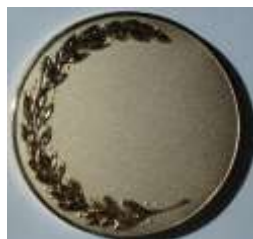
ASA Medal (back)

This document is confidential material of the Australian Society of Anaesthetists and is not to be further distributed, published or broadcast without the express permission of the Company Secretary.