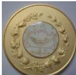
Seruvatu Medal (back)