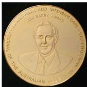
Ben Barry Medal (front)

The recipient will be presented with a medal.