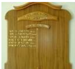
Gilbert Brown Honour Board