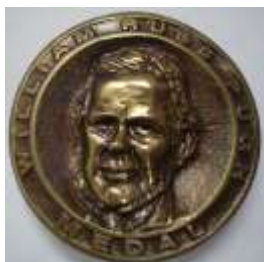
Pugh medal (front)