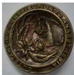
Pugh medal (back)