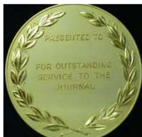
Ben Barry Medal (back)