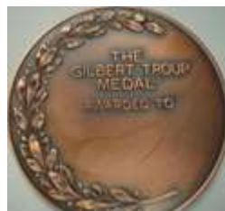
Gilbert Troup Medal (back)

This document is confidential material of the Australian Society of Anaesthetists and is not to be further distributed, published or broadcast without the express permission of the Company Secretary.